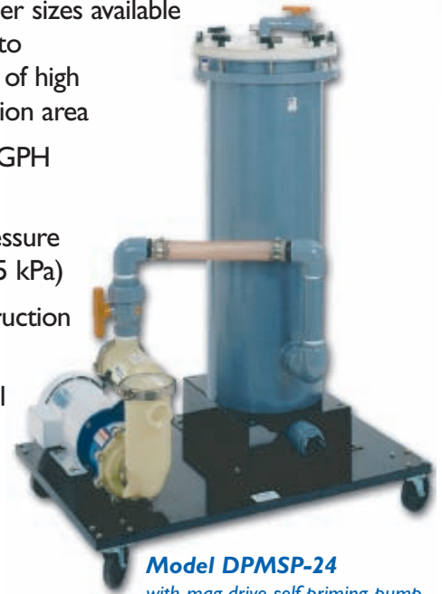
Model DPMSP-24 with mag-drive self-priming pump